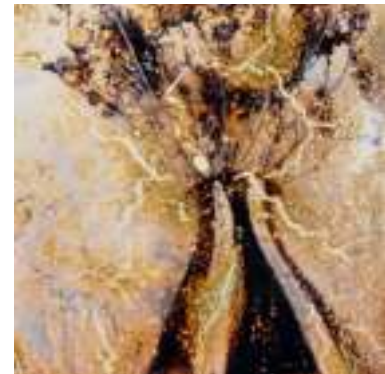
HEAT AND EMULSION