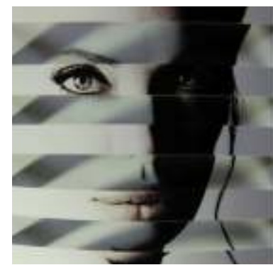
HAND ASSEMBLED MONTAGE