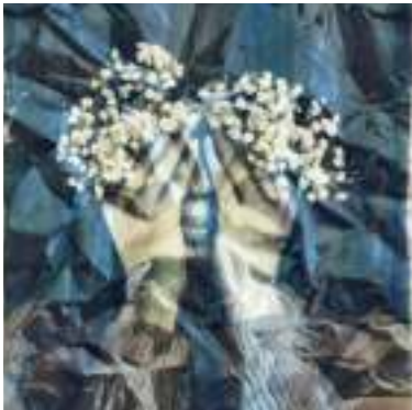
TEXTURE AND DISTORTION