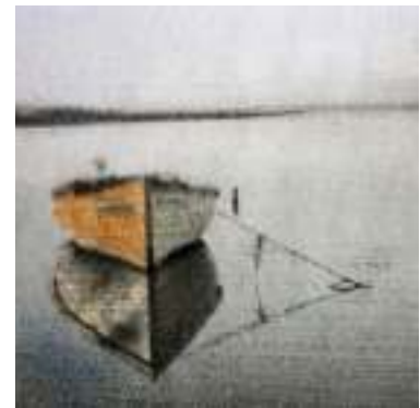
GEL AND SPRAY TRANSFERS