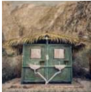
HAND COLOURING B&W PRINTS